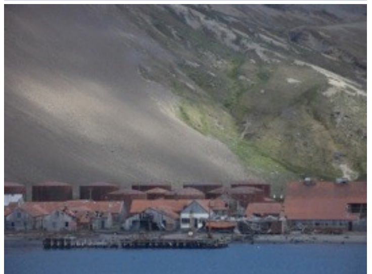
Top - We landed by RIB where the ship couldn't berth Middle - Adelie penguin on an iceberg Bottom - Old whaling station in South Georgia Left Bottom - Seals -playing about 8 feet away