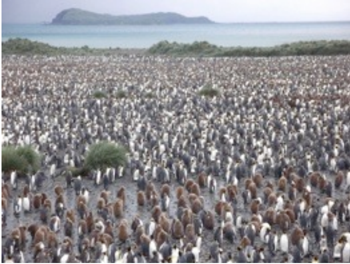
250000 penguins on Salisbury Plain, South Georgia

It has all been go here at 52 degrees south. Since arriving in August 2010 I have been quite busy down in North Arm. We even made a Christmas film with Goose Green school. It was rather like being in Fetlar except with more pupils to work with!!