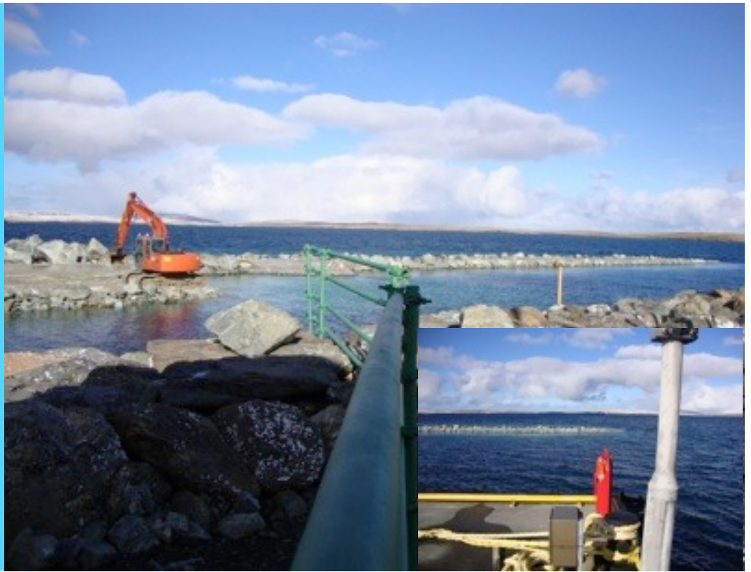
Work is now well underway on the new breakwater and pier at Hamars Ness