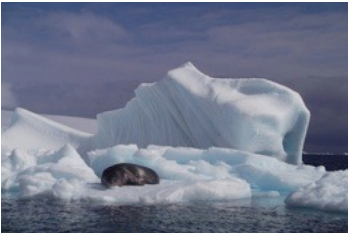
ice seal - seen on a RIB cruise on its own iceberg. Sadly, we didn't land on South Shetland due to high winds and a lack of a breakwater & berthing facility!

As it is now approaching the end of summer, I have just enjoyed my long summer holiday. It was odd to spend Christmas in the sun & I enjoyed going on holiday to Antarctica & even South Shetland.