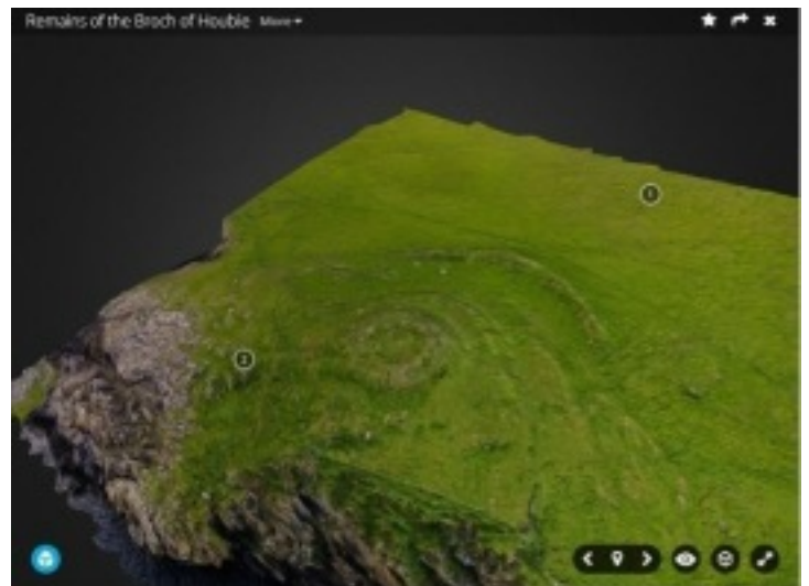
Screenshot Broch of Houbie Computer Model

Our ability to conduct LIDAR style imaging and our 3D modeling is improving in leaps and bounds, and thanks to 'Sketchfab' these models are available for interaction on our website (depending on the availability of your own computing power).