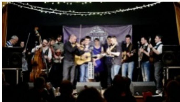
Pictures from the events at Fetlar on the left and Sandwick on the right