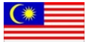
Our featured Countries & Territories from left - Canada, Jamaica, St Helena, Ghana and Malaysia