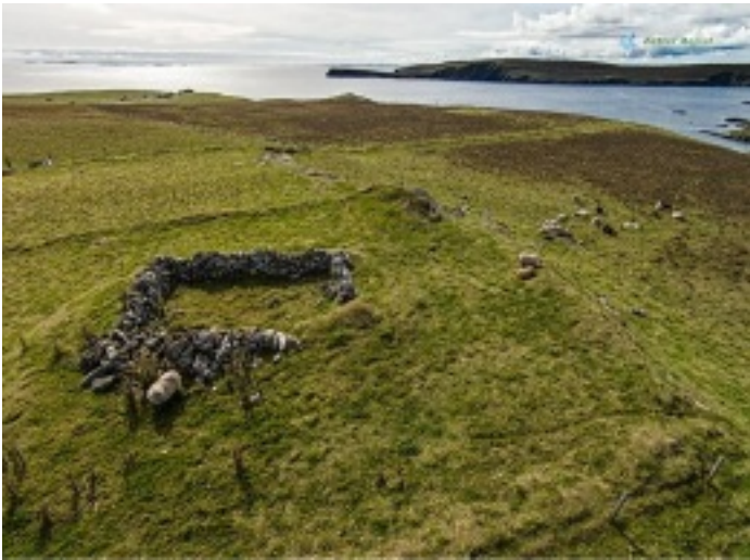
Aith looking SE