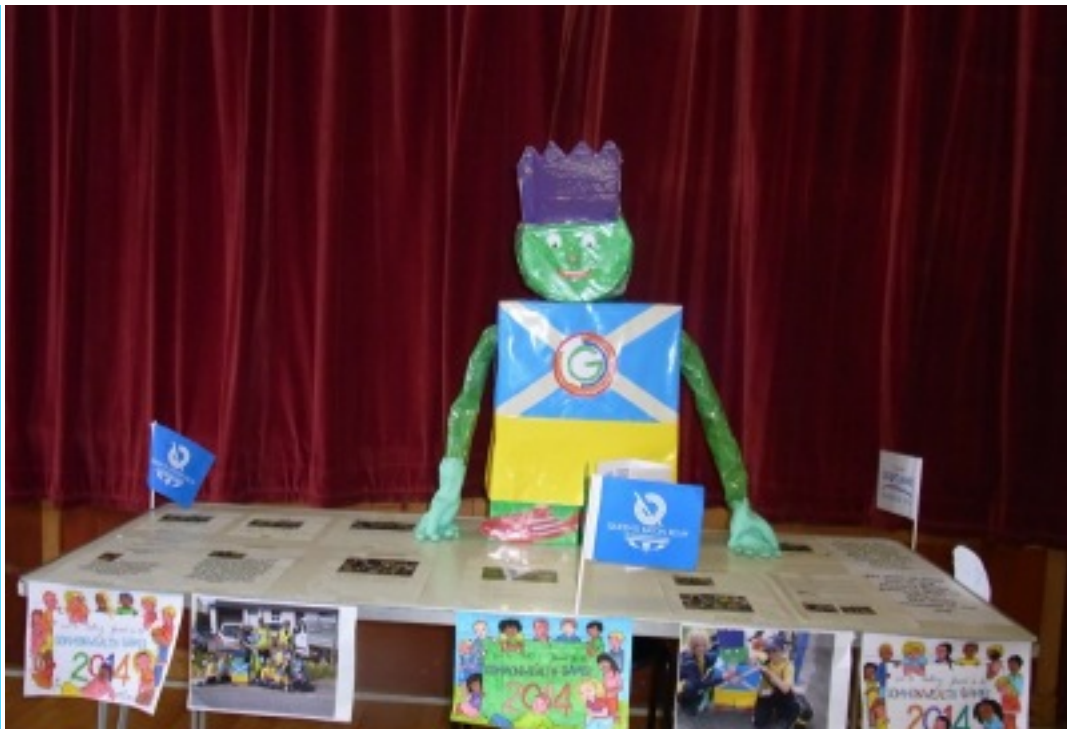
Fetlar Schools very own version of "Clyde"