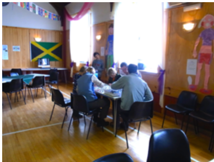
Above - a group hard at work on the Jigsaw on Tuesday. Left - only a small part of the material produced by Fetlar School. Below - enjoying lunch on and browsing displays on St Helena day.

On Tuesday it was the turn of Jamaica to be the featured country. Jamaica was a favourite of the school children because of a certain Usain Bolt! The national dish of Ackee and Saltfish was well received. While we did not manage to get a video link in place but we did find a live streaming radio station, which played all day. Again poor weather hindered any outdoor activities, except for the hardy !