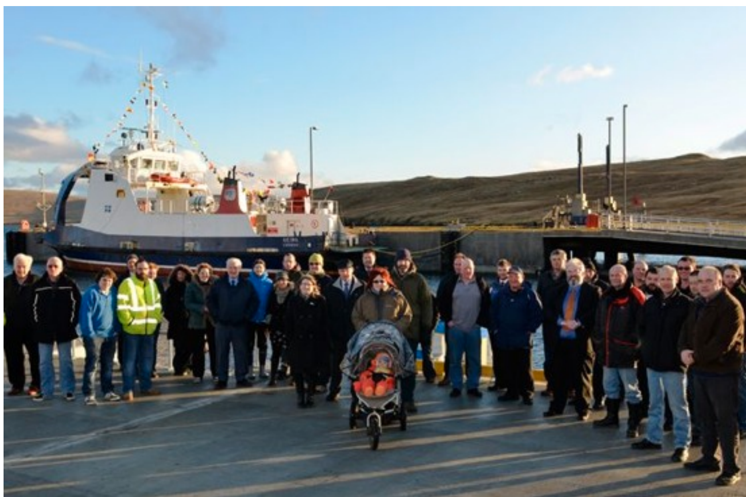
A hardy group of Islanders, Contractors and Councillors and Officials on the new pier, with the Geira in the background