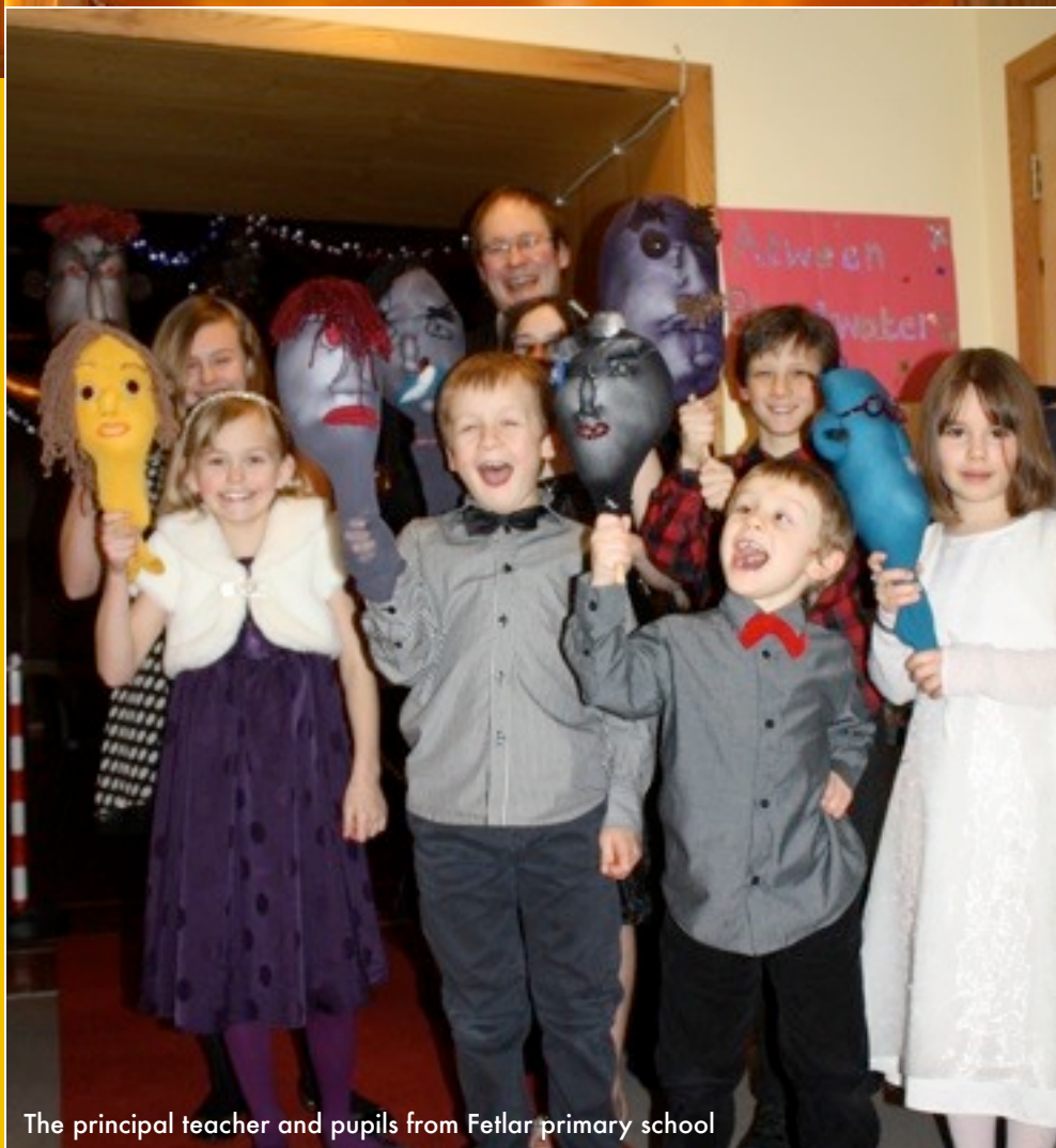
The principal teacher and pupils from Fetlar primary school