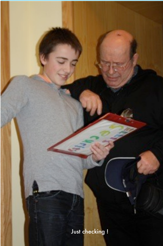
Just checking !