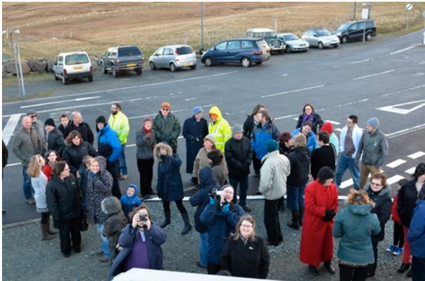
A birds eye view of part of the crowd gathering prior to the opening