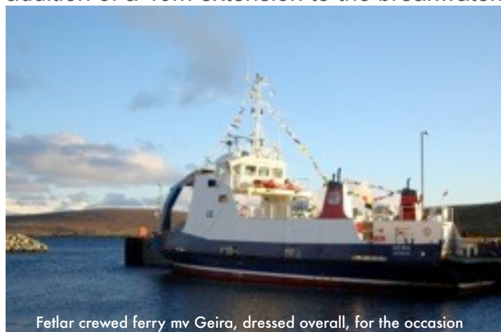
Fetlar crewed ferry mv Geira, dressed overall, for the occasion

The main contractor, Frank L Johnson (Shetland) Ltd, and sub contractor Malakoff Ltd have completed the project to a very high standard and under budget. The total project was completed for £2.55m, £0.11m under the original budget of £2.66m even with the addition of a 40m extension to the breakwater.