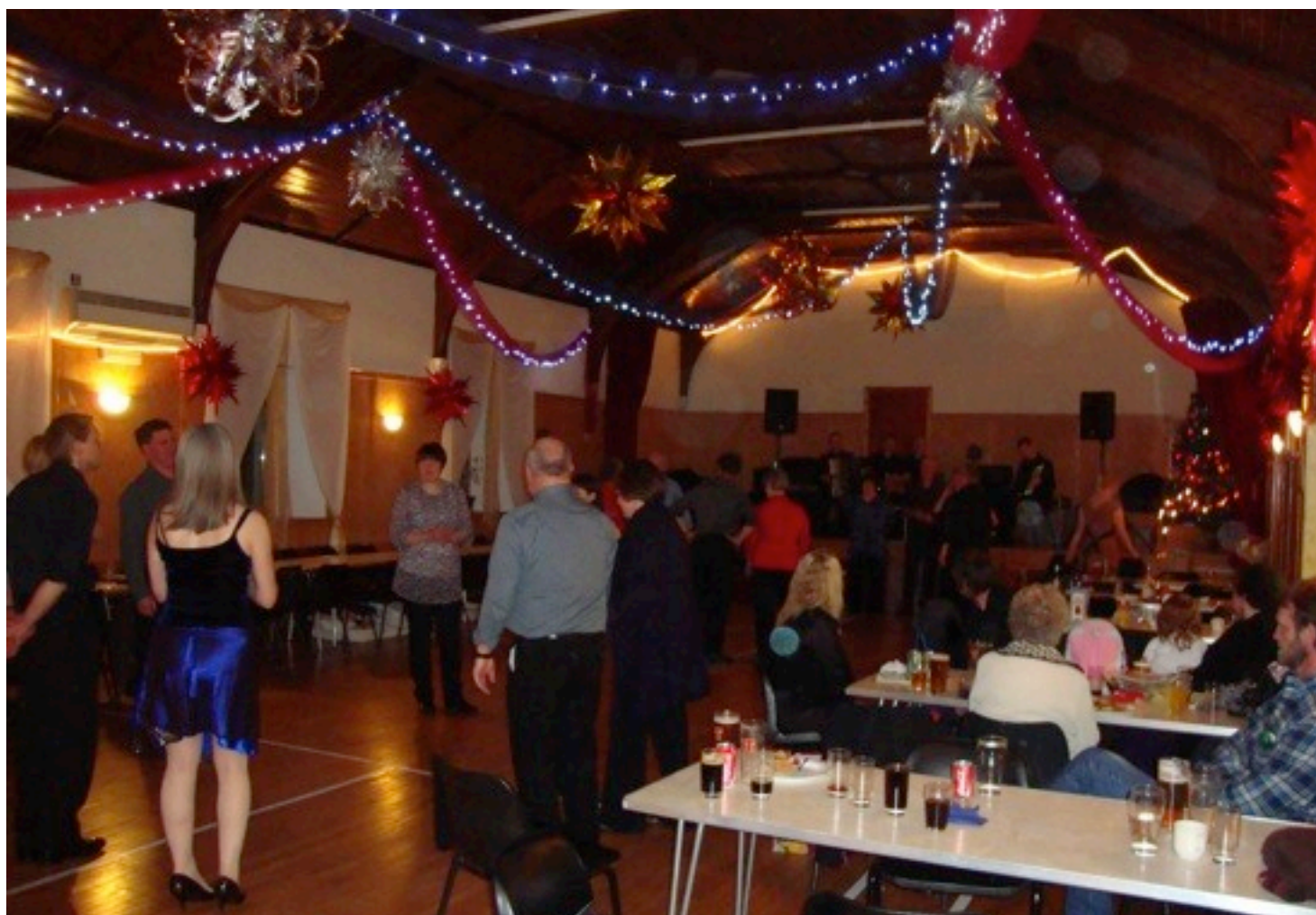
Anyone for the Lancers ! The day was rounded off with a lively dance in the evening to Alan Nicolson's dance band