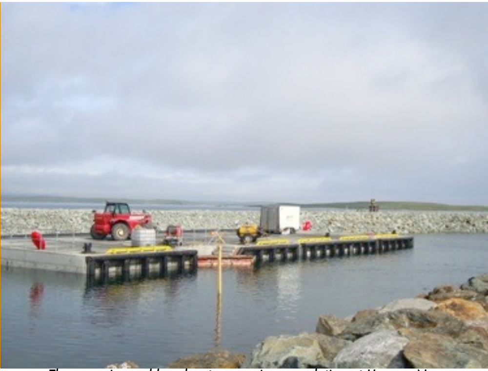
The new pier and breakwater, nearing completion at Hamars Ness